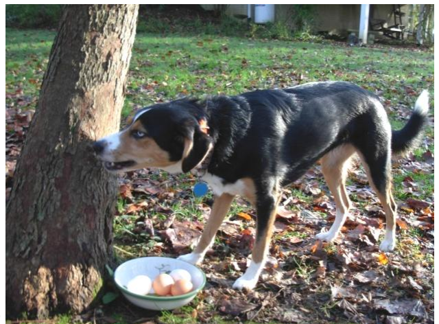
Lucy the "Egg-Dog"